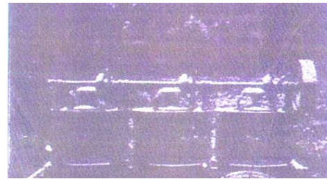
A mill for mixing paint, chemicals, dyes, inks